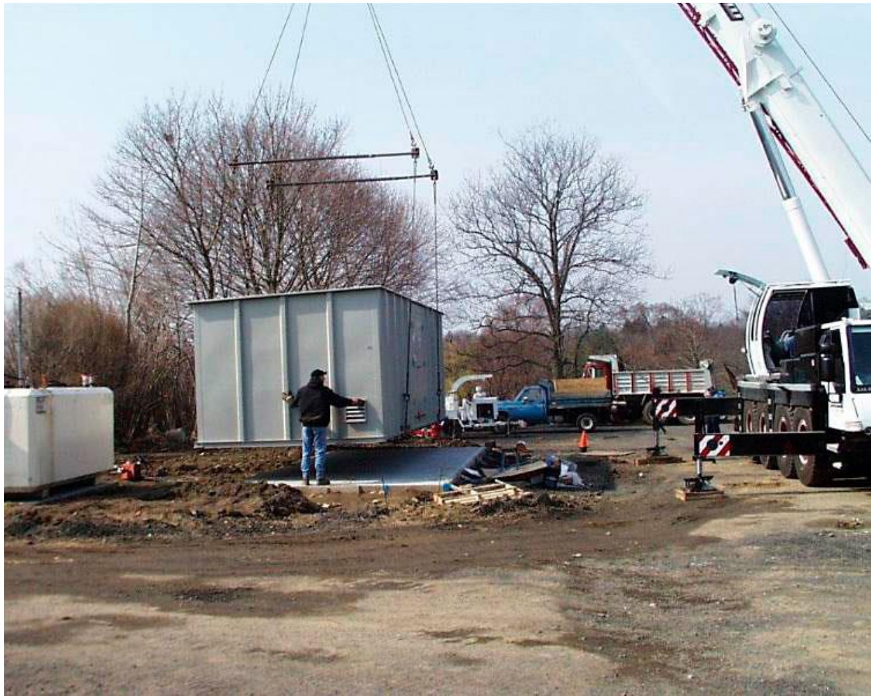
Modular containment units can be installed in many sizes.

Floor drains should include a sump and a chemical pump to move the chemicals discharged to a waste tank as in the figure below. The material can be reclaimed, diluted to label concentrations, and applied to turf areas or collected for disposal using certified hazmat haulers.