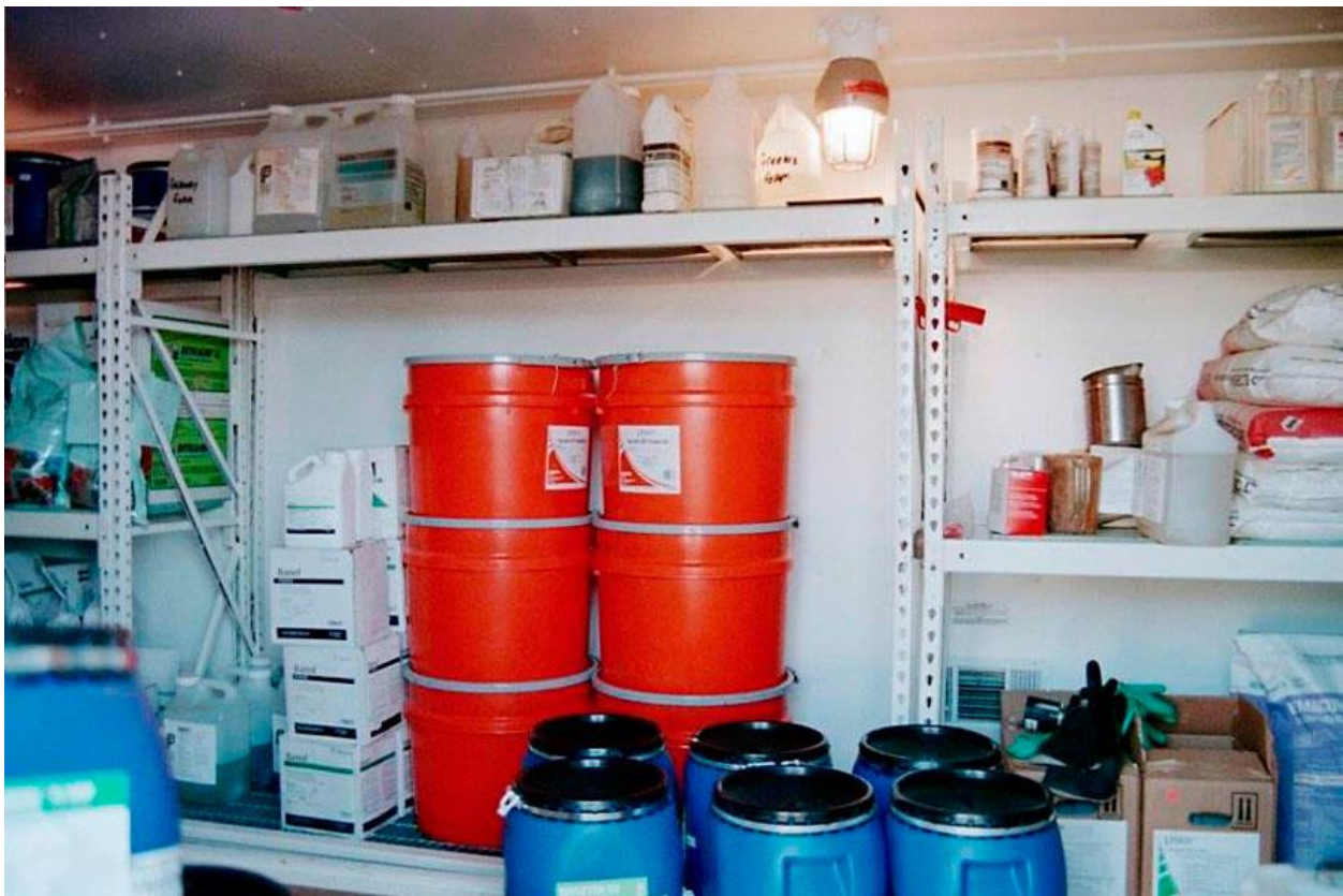
Chemical storage building organization.

The goal of an ideal storage facility is the safe siting and storage of potential contaminants that ensures a high level of water quality protection. NYSDOH does not allow chemical storage or mixing and loading facilities within 100 feet of a potable well. Other requirements include local zoning for the siting of maintenance facility and operations, which vary by town and county. Requirements often include a minimum distance (set-back) from wetlands, surface wells and property lines. The state's Freshwater Wetlands Act requires a 100 ft buffer around wetlands. Some townships have even broader requirements.